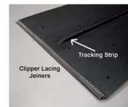
Clipper Lacing Joiners