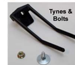
Tynes & Bolts